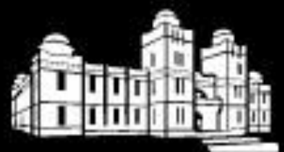
ROYAL ENGINEERS MUSEUM LIBRARY & ARCHIVE