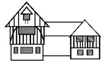
SANDWICH GUILDHALL MUSEUM